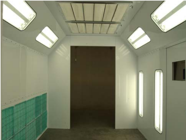
▲ Interior Single Side Downflow

The RSI Side Downdraft Is The Most Economical Model Of Enclosed Equalized Spray Booths. Fresh Filtered Air Is Introduced Evenly Over The Ceiling Of The Booth. Air Requirements Are Greatly Reduced Using The RSI Downdraft Spray Booth. Exhausted Air Is Reduced On Average By Approximately 30% As Compared To Standard Open Front Spray Booths.