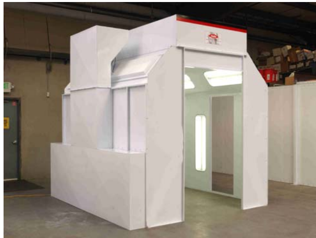
▲ Exterior Single Side Downflow

The RSI Open Front Spray Booths Are The Most Widely Utilized In The Finishing Industry And Provide One Of The Most Economical Means Of "Contaminant Containment" Available Anywhere. All RSI Open Front Spray Booths Are Available Companion Flanged For Screw Together Or Bolt Together Construction.