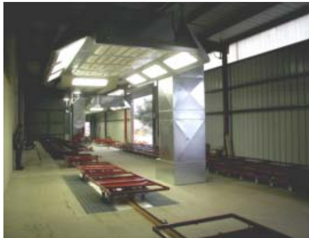
▲ On-Line Sanding Booths ▼

The RSI Cross Draft Cartridge Filtered Sanding Booth Is An Economical Choice For Most Finishing Operations. Like The Other RSI Sanding Booths, This Unit Features 100% Recirculation Of Filtered Air With The Convenience Of The Disposable Cartridge Filter. Cartridge Filter Booths Are Available With An Optional Pulse Blow Down Cleaning System To Maximize Cartridge Life.