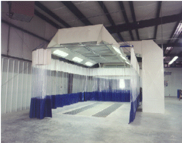
Batch Type Sanding Booth

The RSI In Floor Down Draft Sanding Booth Offers The Ultimate In Operator Friendly Dust Containment. All Down Draft And Cross Draft Sanding Stations Feature 100% Recirculation Of Filtered Air Thereby Minimizing Air Replenishment Issues In Your Plant. Most Systems Can Also Be Supplied With An Exhaust Option That Allows For Exhaust To Atmosphere During Operation In Summer Months.